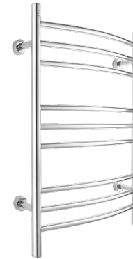
TW-R09PS-HP Riviera $779.00