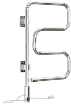
TW-E4PCP Elements $209.00

Professionally crafted and designed to fit any budget, our range of Electric Heated Towel Warmers are a key addition to any bathroom and operate at a fraction of the cost of most liquid filled models. Made with superior hand-finished quality metals, each model includes hidden wiring mounts for single stud installation. Pricing listed is in CAD Dollars.