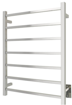
TWS2-TAH07PH Tahoe 7 $499.00