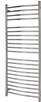
TWS3-VID21PH Vida $1,099.00