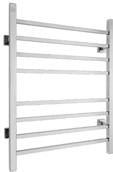
TW-SR08PS-HP Sierra $799.00