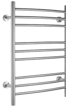
TW-R09BS-HP Riviera $779.00