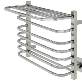
TWS1-VNC06PH Vancouver $499.00