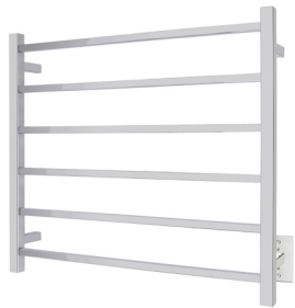
TWS2-TAH06PH Tahoe 6 $469.00

Professionally crafted and designed to fit any budget, our range of Electric Heated Towel Warmers are a key addition to any bathroom and operate at a fraction of the cost of most liquid filled models. Made with superior hand-finished quality metals, each model includes hidden wiring mounts for single stud installation. Pricing listed is in CAD Dollars.