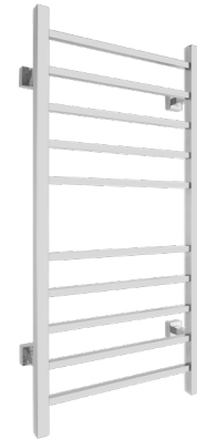
TW-MT-10PS-HP Metropolitan $999.00