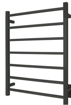
TWS2-TAH07KH Tahoe 7 $599.00