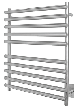
TWS7-ROM10BH Rome $539.00