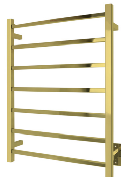
TWS2-TAH07GH Tahoe 7 $599.00