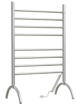
TW-BC-08BS-FS2 Barcelona $399.00